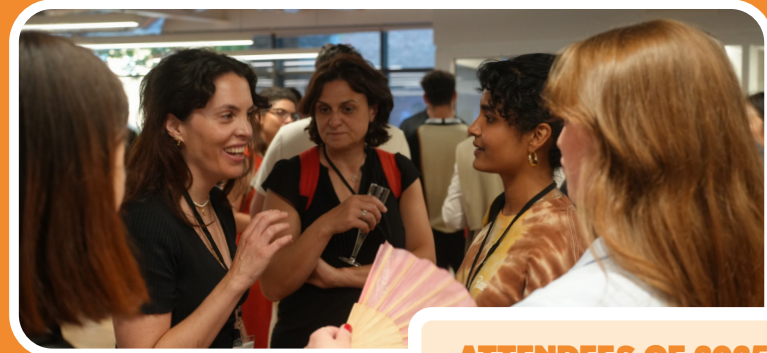
ATTENDEES OF 2025