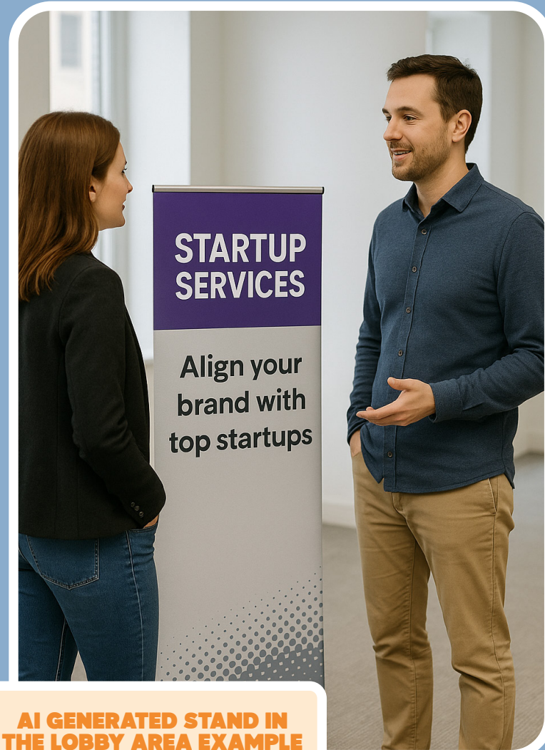
AI GENERATED STAND IN THE LOBBY AREA EXAMPLE